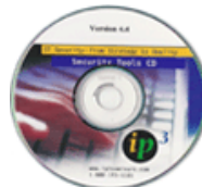
IP3 Security Tools CD